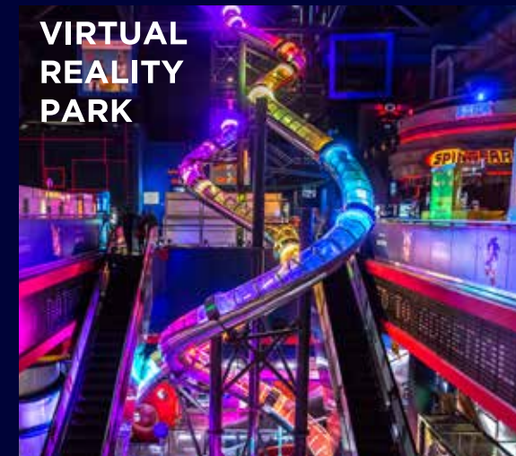
VIRTUAL REALITY PARK