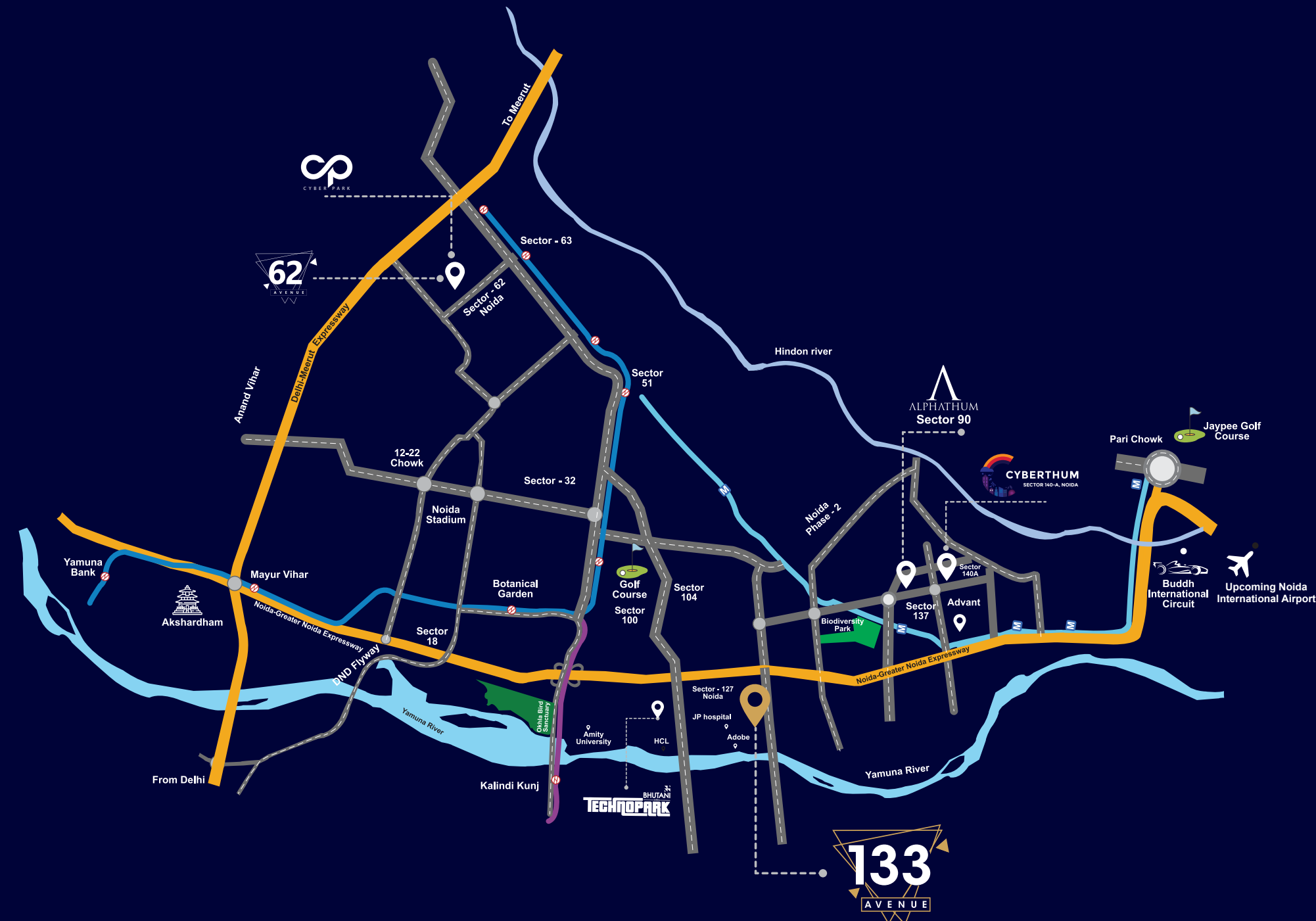
Map is not-to-scale and is for graphical representation only.